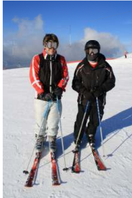
(Leaders can be cool as well!).

After the success of previous trips, once again, young people and leaders from youth groups across the District are taking part in a Ski Trip during the half term week in February 2012. The group will stay at the Youth Hostel, Annecy, and ski at ski resorts nearby. The trip is open to beginners and experienced skiers.