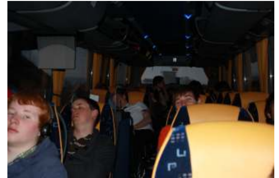
([Such energy on the coach!)

Saturday Coach returns to Calais. After crossing channel, return to District arriving back soon after midnight.