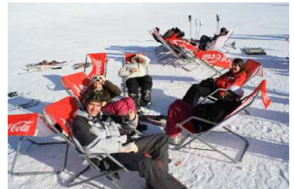
Part of the 2011 Group on the slope!