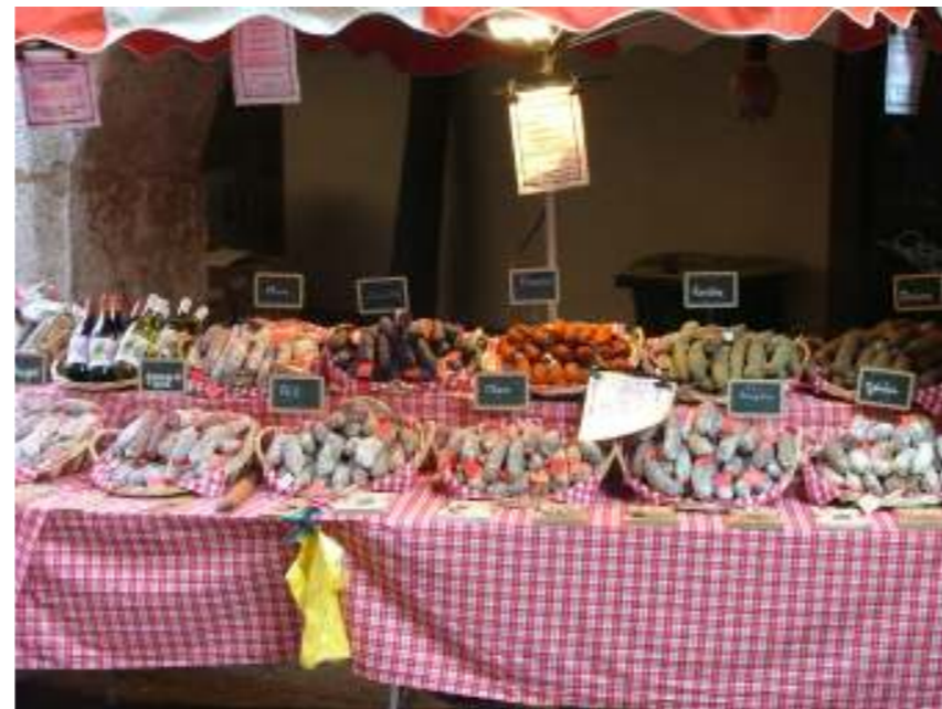
The market at Annecy

THE WOLVERHAMPTON & SHREWSBURY DISTRICT OF THE METHODIST CHURCH