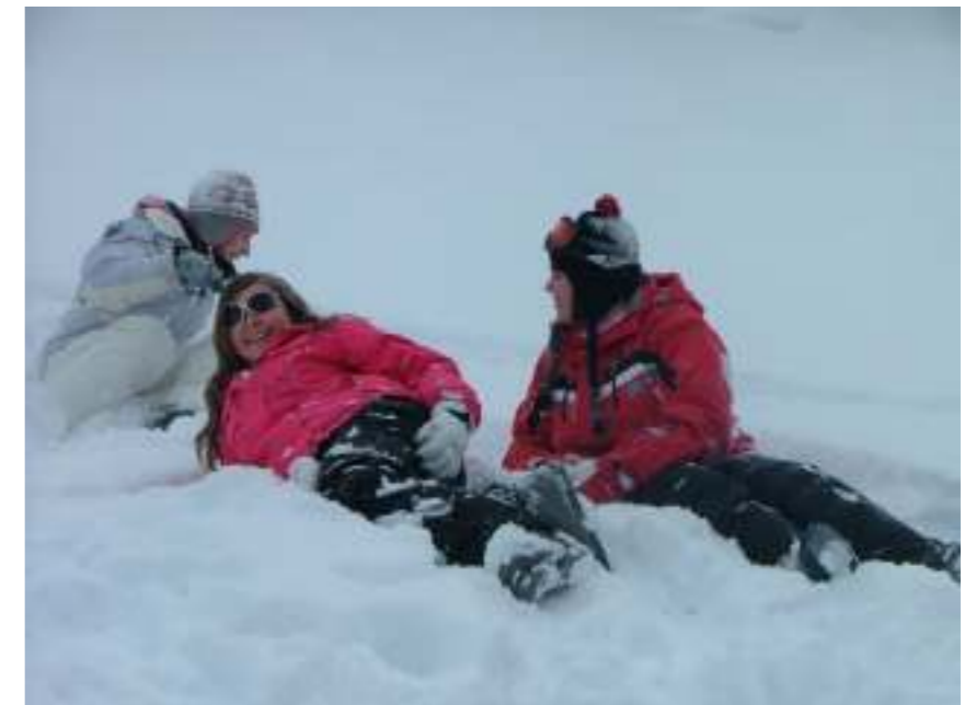
([Its tough on the slopes!])

Saturday Coach returns to Calais. After crossing channel, return to District arriving back soon after midnight.