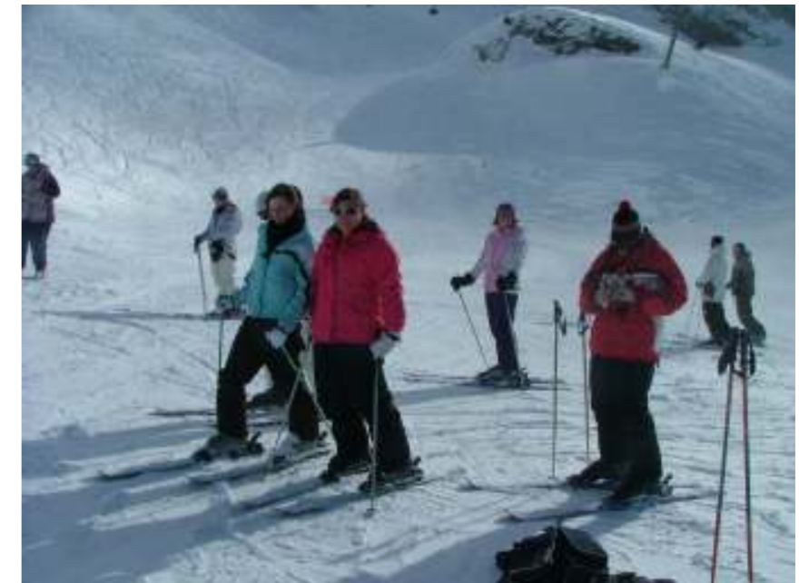
Part of the 2010 Group on the slope.